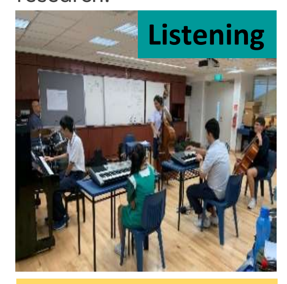
Music Analysis and Perception

MEP students will learn music through hands-on experiences to develop them in the areas of music listening and analysis, creating, performing as well as research.